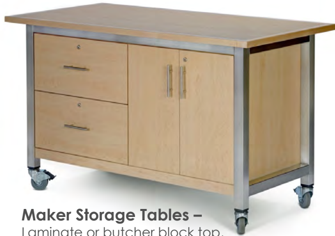
Maker Storage Tables – Laminate or butcher block top, various storage configurations