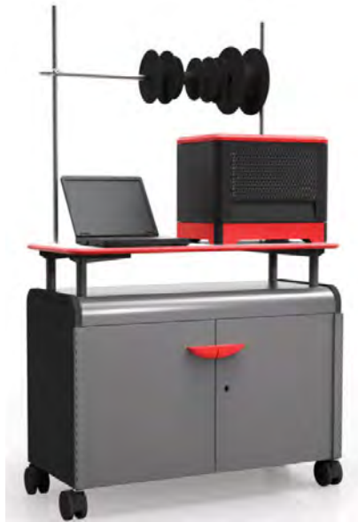
Maker Cart – Lockable storage, integrated power, ventilation ports, casters.