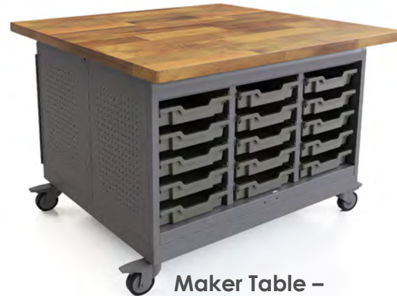
Maker Table – Laminate or butcher block top, various storage configurations, optional doors.