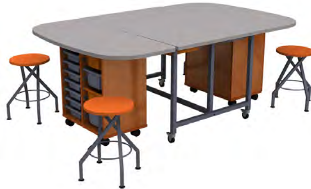
Carlo - Stool