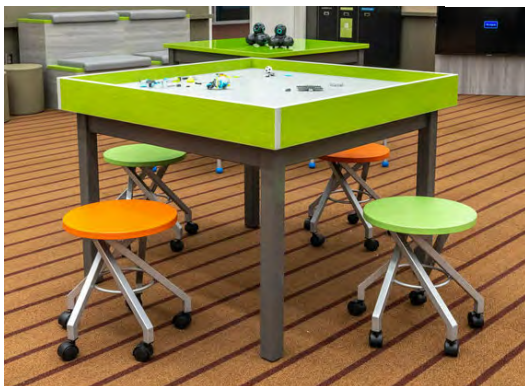
Stellar Table - Various sizes, optional Lego top. Carlo Stool