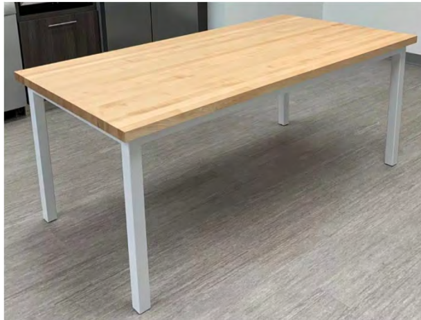
Maker Tables – Laminate or butcher block top , various heights, sizes, optional casters