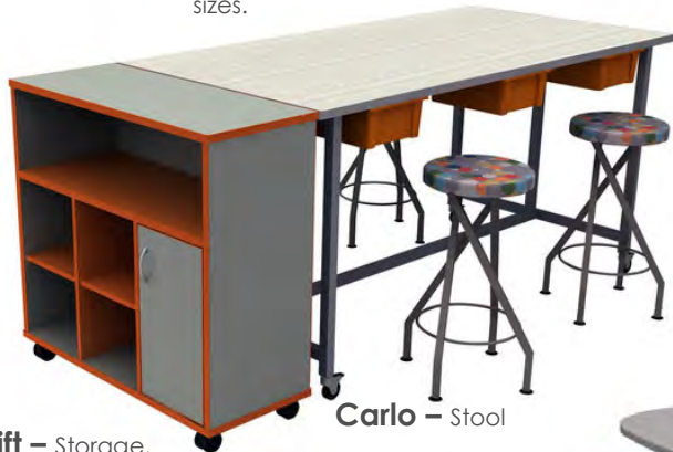
Drift - Storage, various sizes & configurations