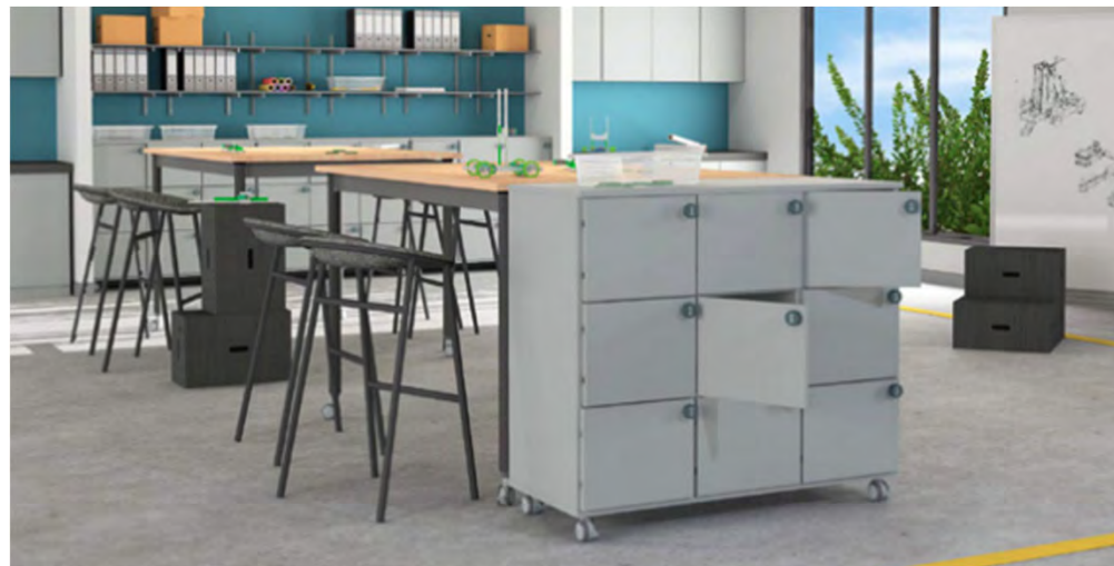
Versatilis Tables – Various heights, sizes, optional casters Xbrick seat, Flow whiteboard, Stash Cubby,