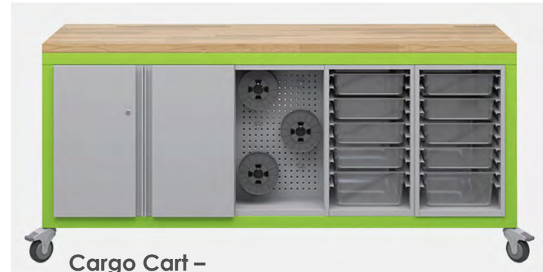
Cargo Cart – Various storage options for different material types.