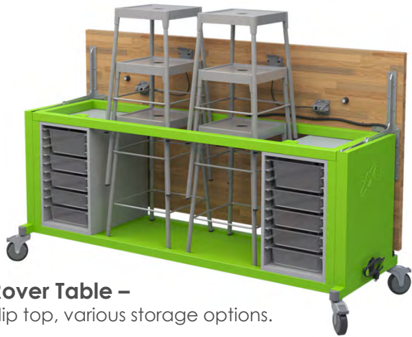
Rover Table – Flip top, various storage options.