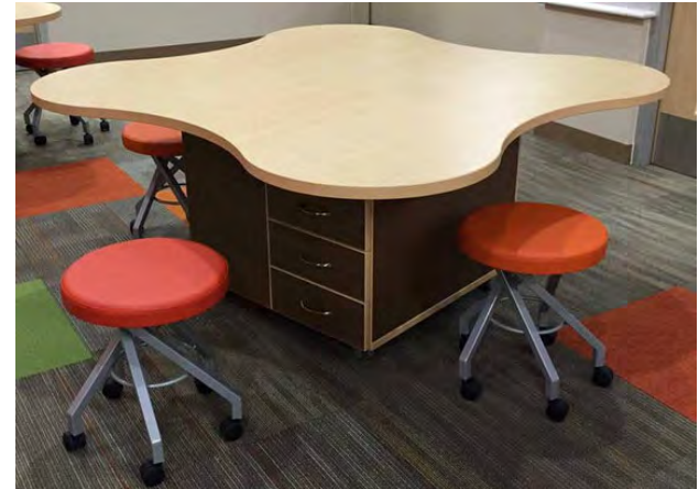
Work+Box - Various sizes & bases. Carlo Stool