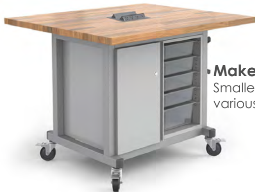
Maker Table 2 – Smaller footprint with various storage options.