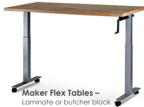
Maker Flex Tables – Laminate or butcher block top, height adjustable, flip top, nesting, Various sizes