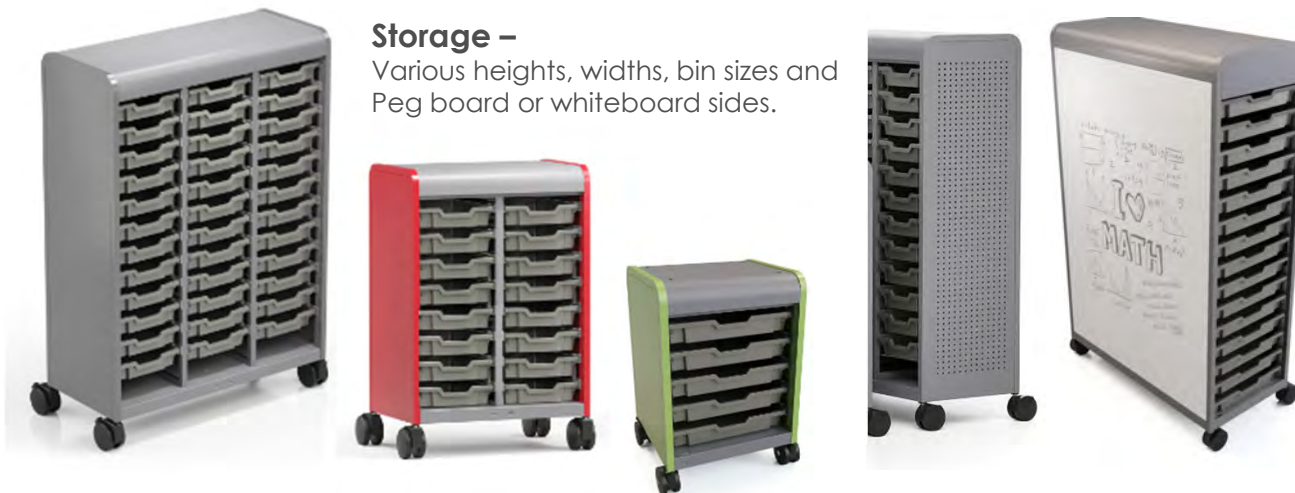
Storage – Various heights, widths, bin sizes and Peg board or whiteboard sides.