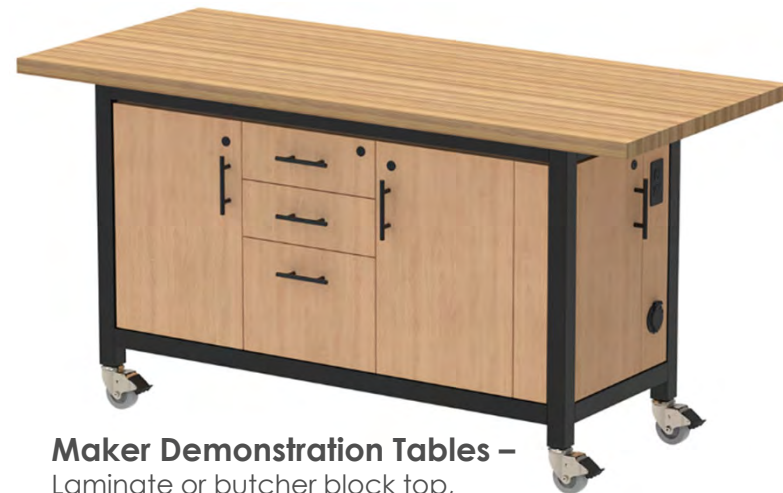
Maker Demonstration Tables – Laminate or butcher block top, various sizes, storage configurations, integrated power