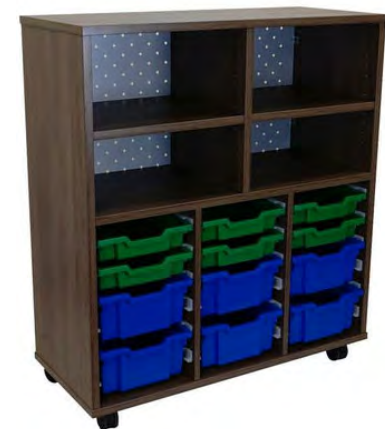
Drift - Storage, various sizes & configurations