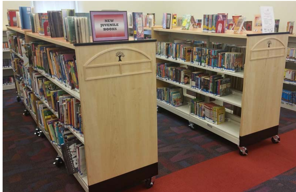
East Berlin Public Library