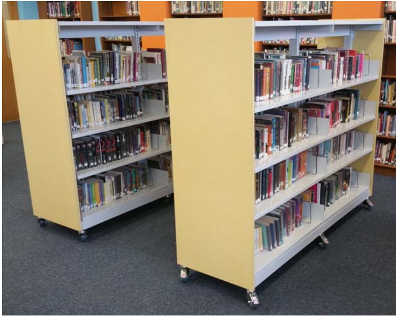
Senneca Middle School