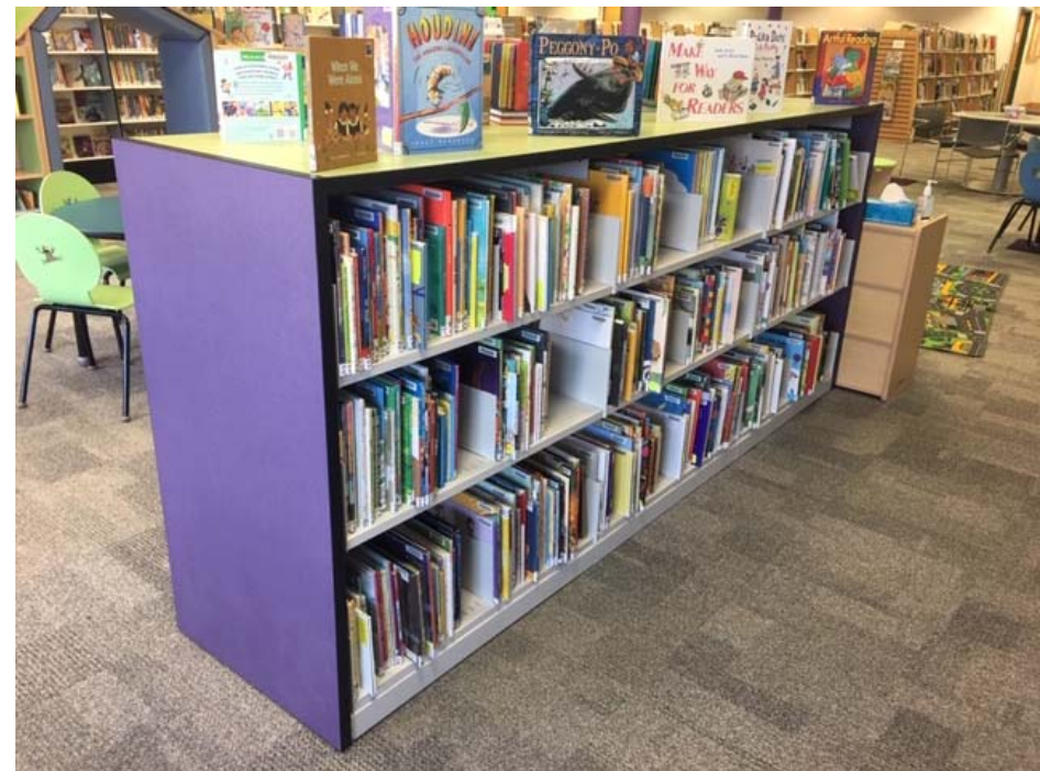
Mountain Road Branch