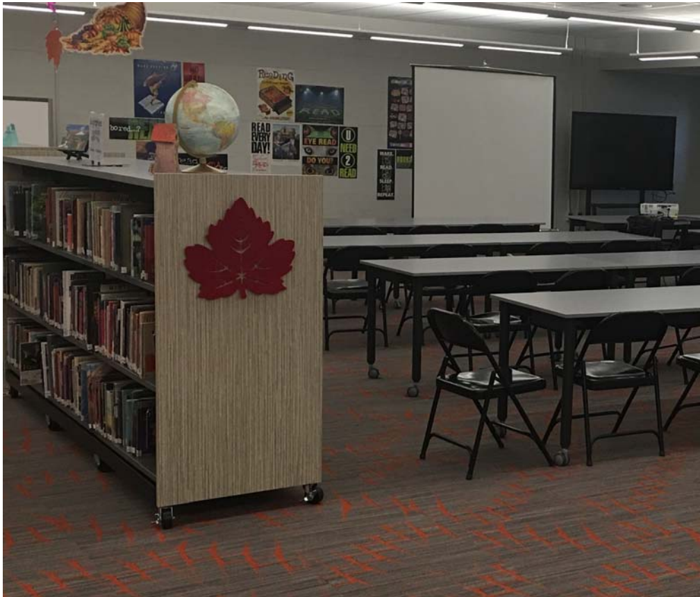
Pennwood Middle School