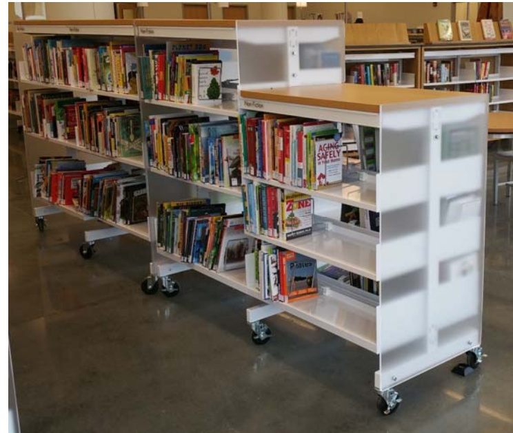
Free Library of Philadelphia