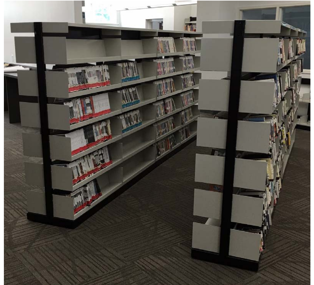
Media Upper Providence Public Library